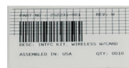
Partial Overstrike Example (T6000e ODV-2D)

The ODV-2D can verify and validate barcodes as they are printed. The data printed on the label is validated to match the data sent from the host (native commands only). The barcode image is verified to comply with the ISO standards.