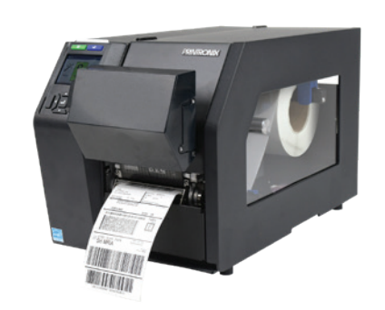
Barcode Verifier (T8000 ODV-2D)