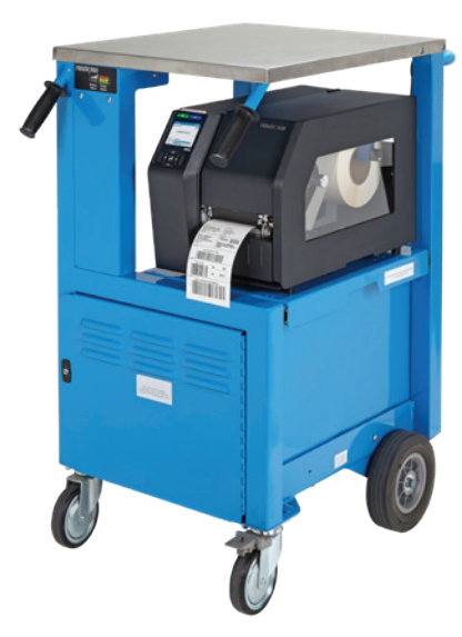
Powered Mobile PrintCart